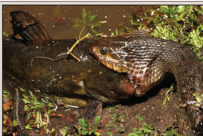
FIG. 1. Nerodia floridana consuming an Ameiurus sp. (bullhead catfish) at Grassy Waters Preserve, Palm Beach Co., Florida, USA.